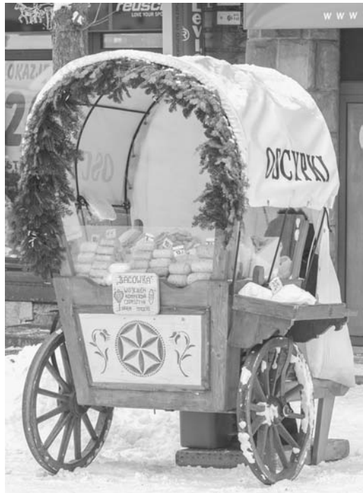
Cheese cart featuring Poland’s famous Oscypek cheeses in Krupowki street in Zakopane, Poland.

Rurki z kremem are long thin tubes of wafer-thin pastry filled with cream. Gofry (from the French gaufre ) are Belgian-style waffles cooked on a griddle and topped with